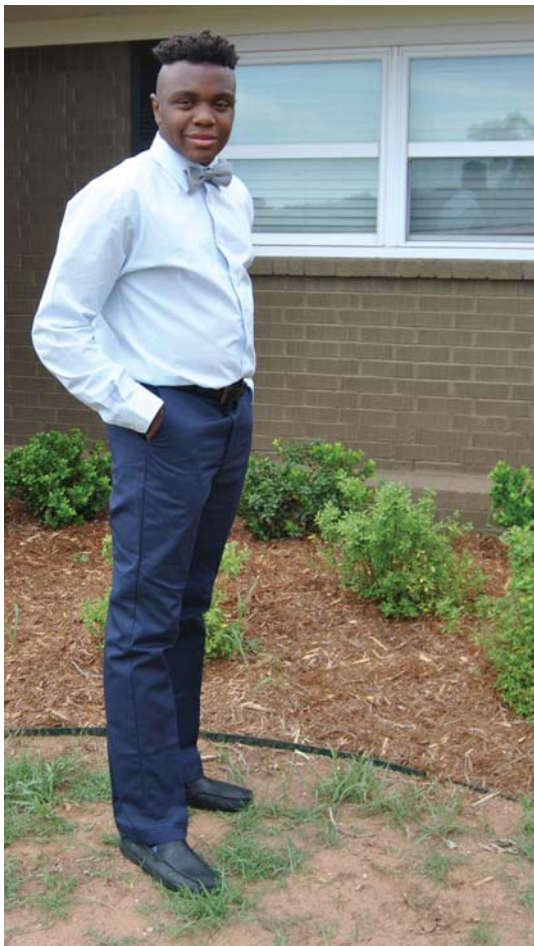
DJ stands ready to move on to high school