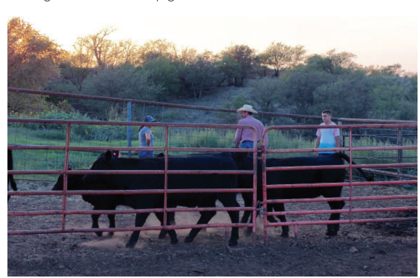
Learning how to work with cattle